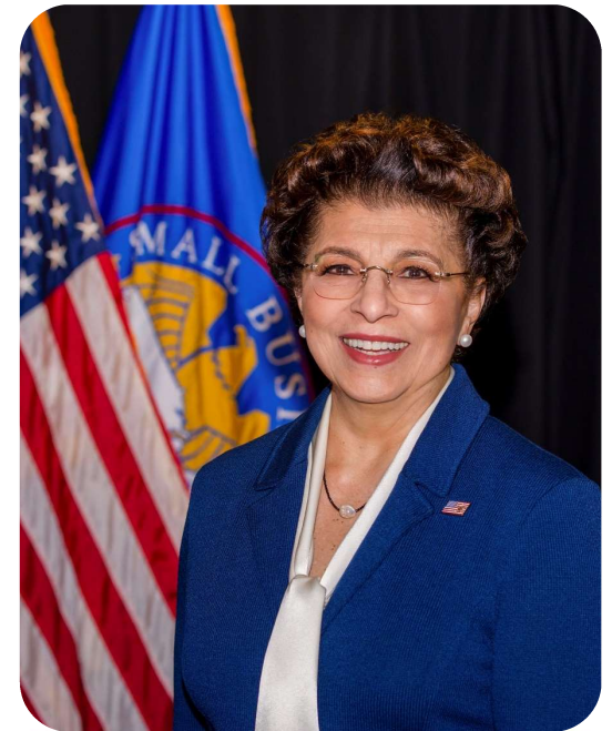
Administrator Jovita Carranza

Upon a request received from a state's or territory's Governor, SBA will issue under its own authority, as provide by the Coronavirus Preparedness and Response Supplement Appropriations Act that was recently signed by the President, an Economic Injury Disaster Loan declaration.